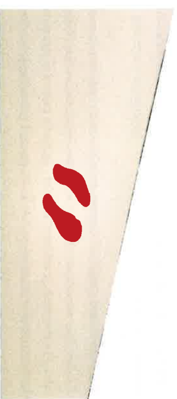
Reto Boller H-8.1 ( Einmal richtig ), 2018 wood, bandage, adhesive film, 110 x 57 x 69 cm